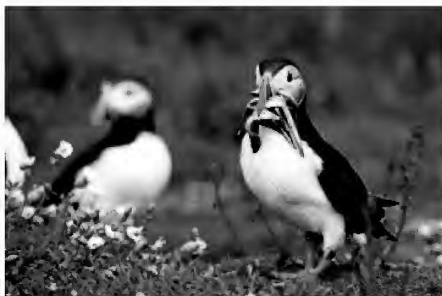
Atlantic Puffin Fratercula arctica

From gannets to seagulls, puffins to penguins, all seabirds suffer the same drop in birth rates when the supply of fish drops to less than a third of maximum capacity. These are the results of an international study on the relationships between predators and prey in seven ecosystems around the world. Based on nearly 450 cumulative years of observation, the research team compared the growth in fish supplies and the reproductive patterns of 14 species of coastal birds. These birds mainly feed on sardines, anchovies, herring, and prawns, all of which